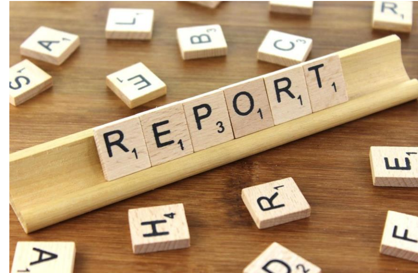
A wooden board with letters on it spelling REPORT.