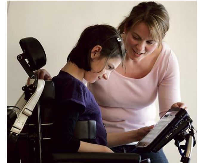
Older woman leaning over and showing young woman in wheelchair use of iPad.