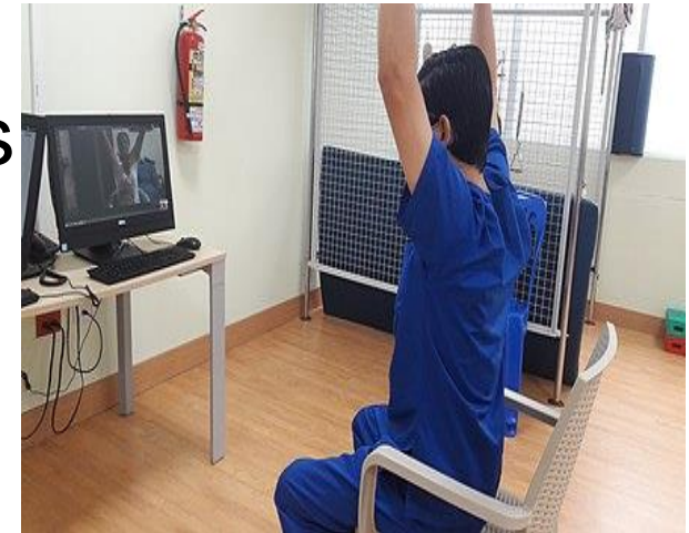
Photo of man in chair stretching watching computer with remote supports.