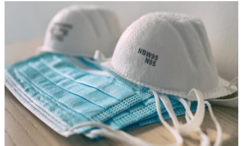
N95 masks and blue paper masks on a table.