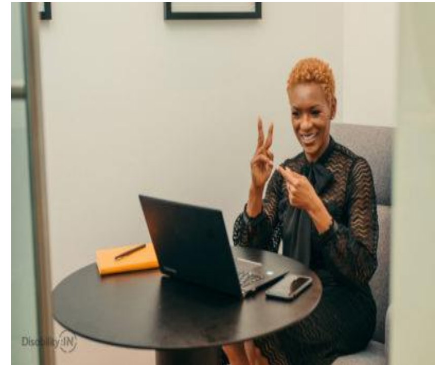
A woman sitting in front of a laptop with hands up signing.