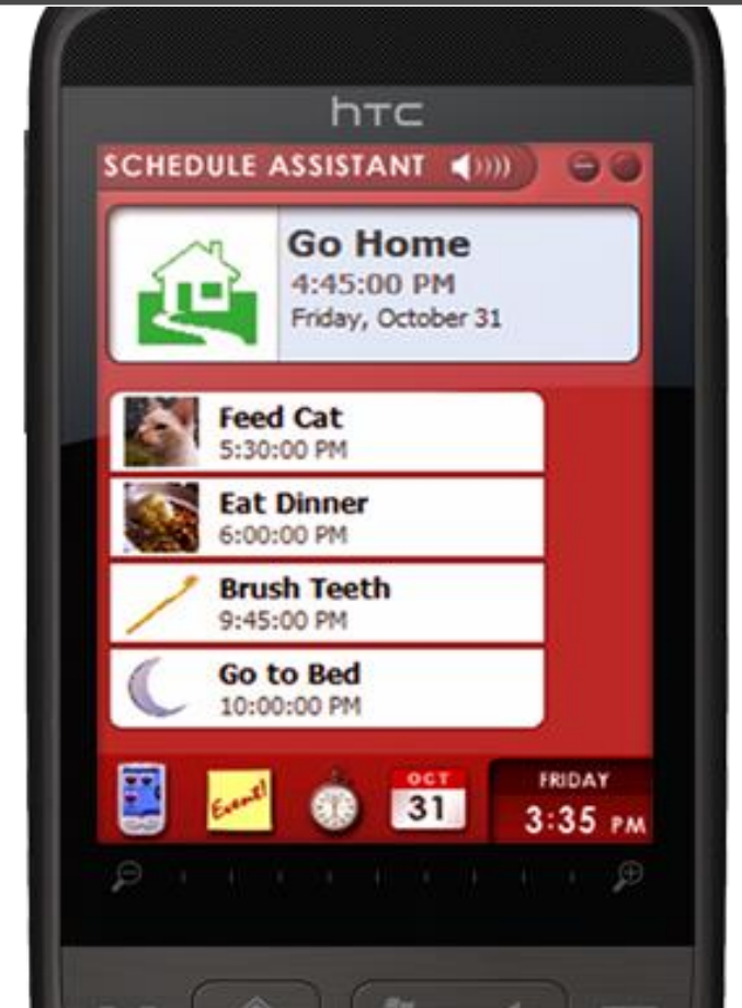
Photo of Smart Phone